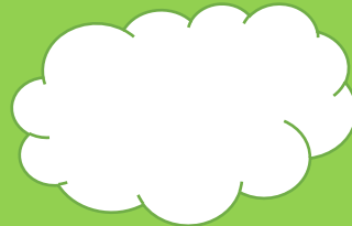
a closed curve

3. Write down top 5 lessons from the Movie "Super30" (ANAND KUMAR) on colourful A4 size sheet.