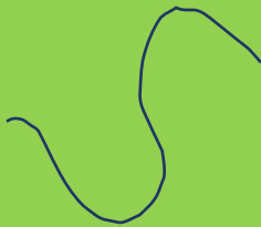
an open curve